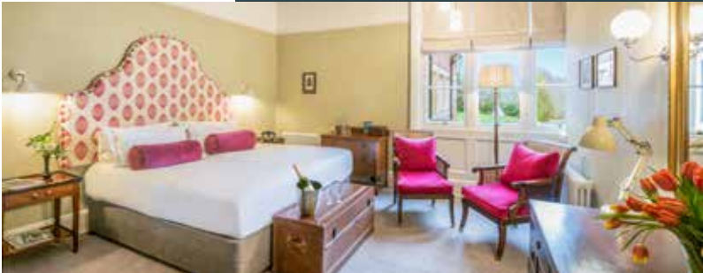
BURLEY MANOR BURLEY