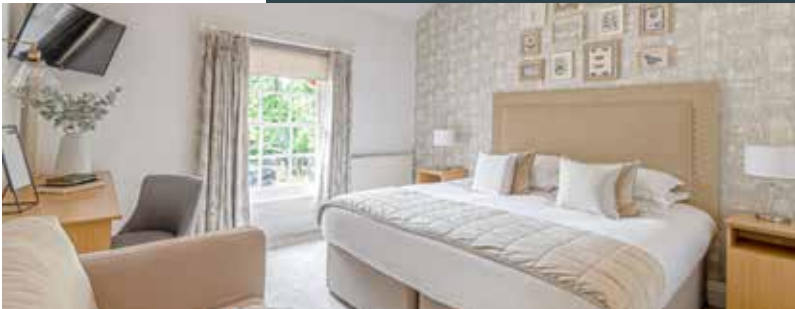
BARTLEY LODGE CADNAM