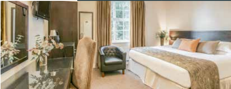
FOREST LODGE LYNDHURST