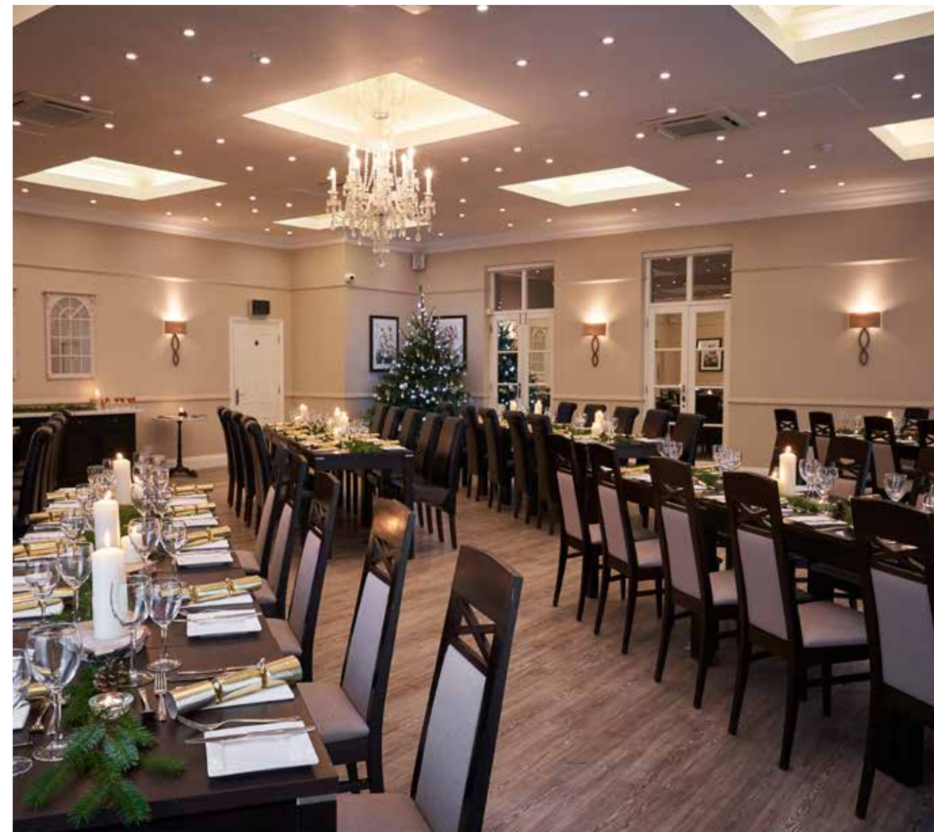
Forest Lodge, Pikes Hill, Romsey Road, Lyndhurst, SO43 7AS

If you are concerned about any food allergies or dietary requirements please speak to a member of the team who would be happy to assist. Please note a discretionary optional 10% service charge will be added to your final bill.