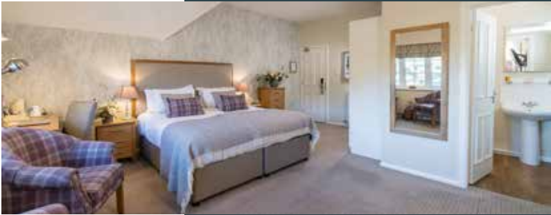
BEAULIEU HOTEL BEAULIEU