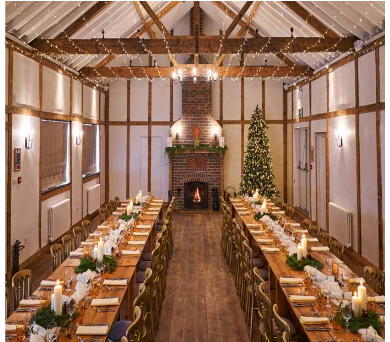
Burley Manor, 1 Ringwood Road, Burley, Hampshire, BH24 4BS